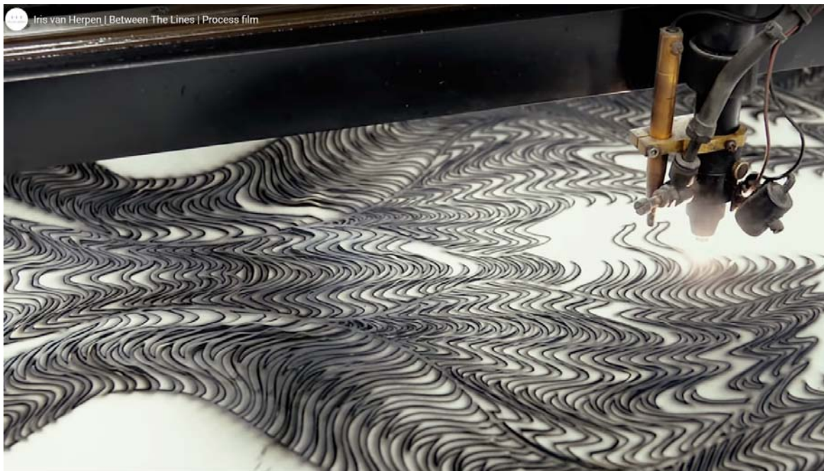
“seijaku” collection, visualisation of sound waves laser cutter and different techniques