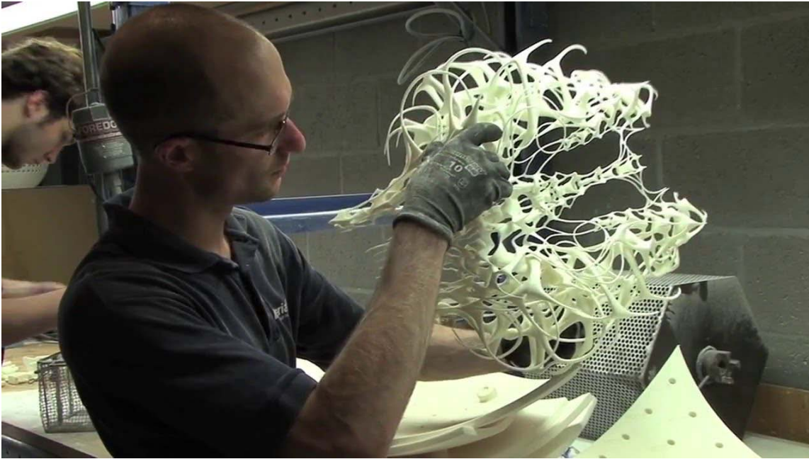
early stages of 3D printing a dress