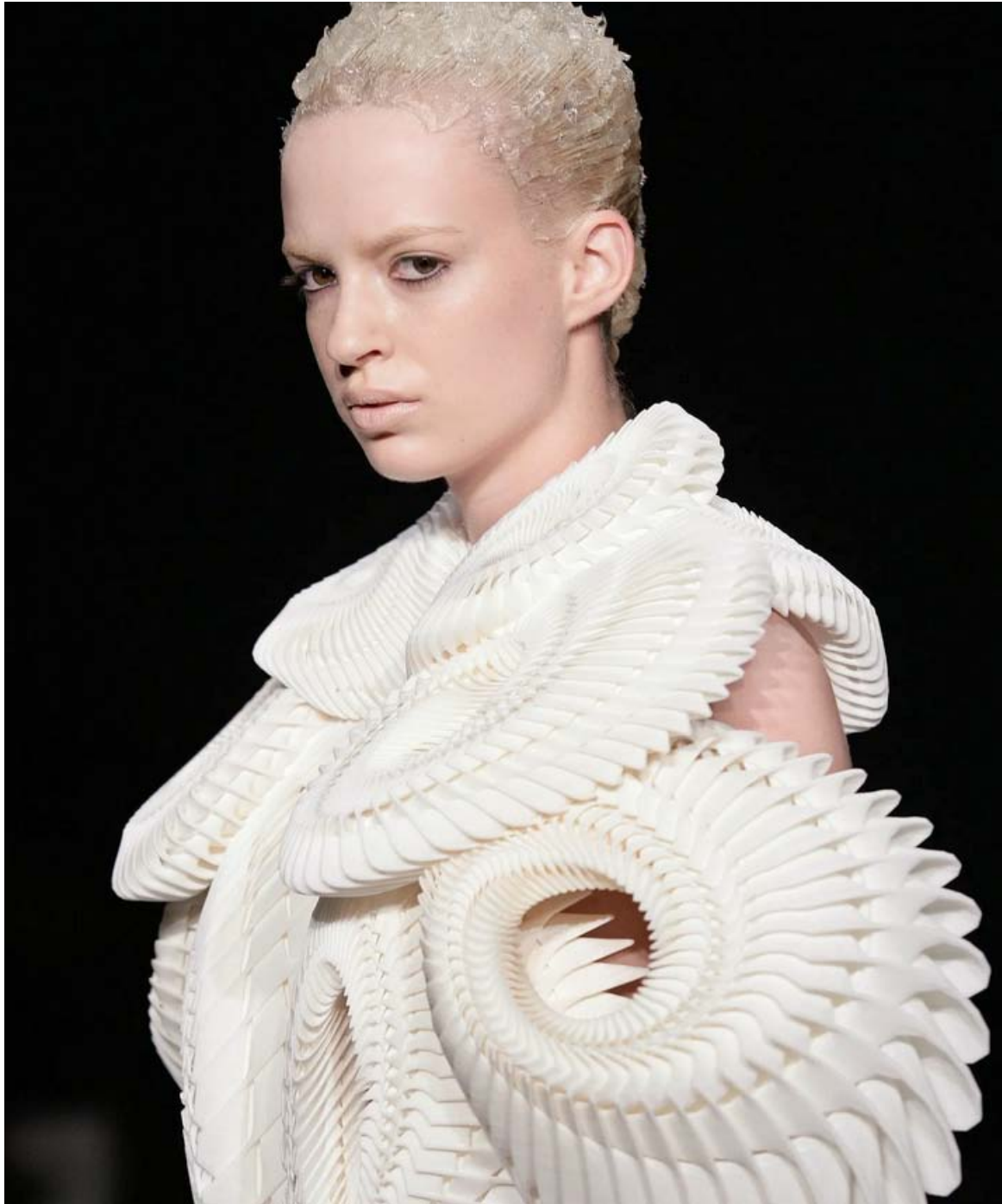
3D printed dress spring/ summer 2011 ready to wear collection

iris van herpen fashion and architecture