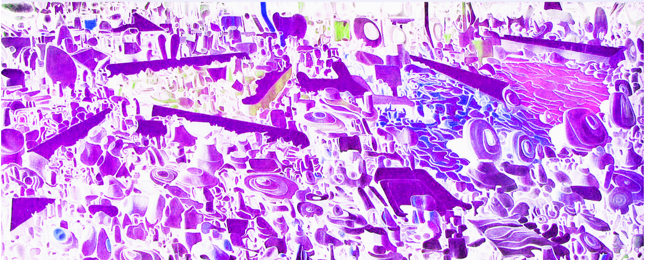
edit of Yves Tanguy's Multiplication of the Arcs (1954)

What does infrastructure mean today? Our digital environments seem to expand by constructing fictitious relations between fundamentally different dimensions: the physical space and the immaterial layer of data, the tangible and the intangible, people and things, things and systems, spaces and symbols. They invite us to perform all kinds of activities upon the suggested relations – stretching them, unwinding, tinkering, connecting, opening up, take, transfer, engender, absorb, invigorate, simulate, stimulate, inflate, protect, freeze, wrap, to name but a few.